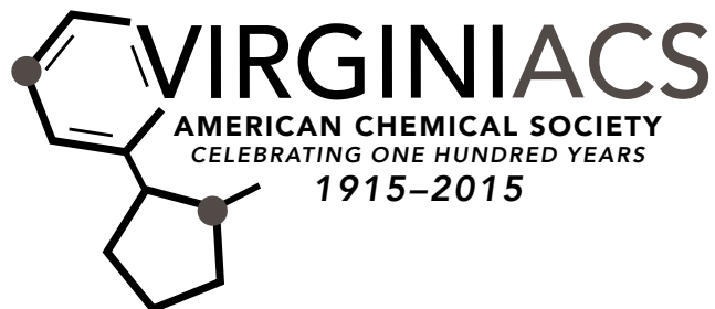
Two, White Background