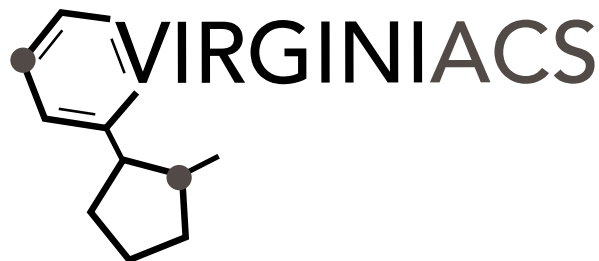
Two Color, White Background